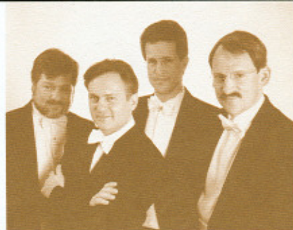
Orion String Quartet